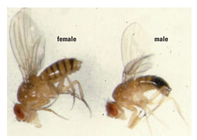
Figure 1. Determining the Sex of Fruit Flies