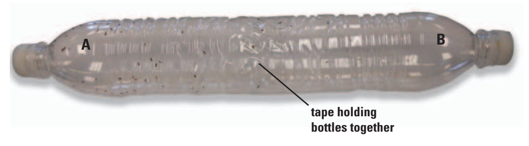
Figure 3. Choice Chamber

Step 1 Prepare a choice chamber by labeling both ends with a marker — one end "A" and the other "B" (see Figure 3). Cut the bottom of the bottles, dry the interior thoroughly, and tape them together. Remove any paper labels.